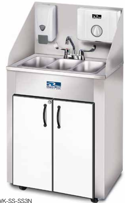
ESPRWK-SS-SS3N (White/Black Doors)

Colors, styles and availability may change without notice.