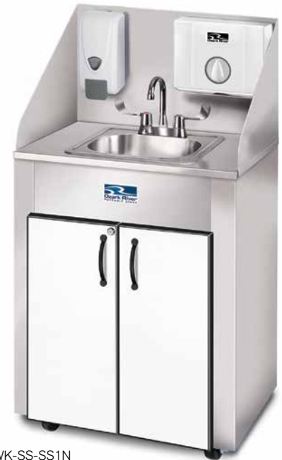
ESPRWK-SS-SS1N (White/Black Doors)

Colors, styles and availability may change without notice.