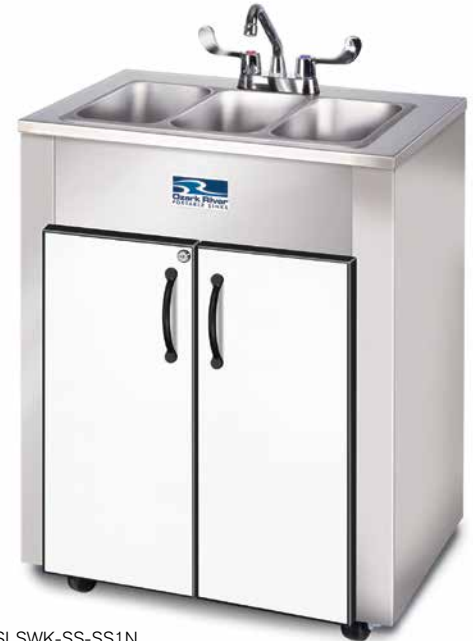
ESLSWK-SS-SS1N (White/Black Doors)

Colors, styles and availability may change without notice.