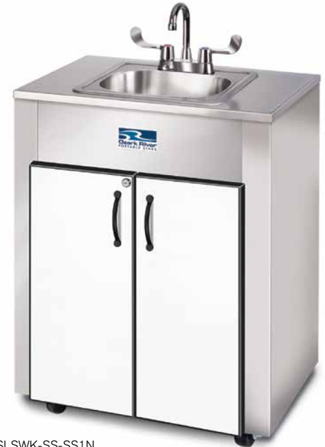
ESLSWK-SS-SS1N (White/Black Doors)

Colors, styles and availability may change without notice.