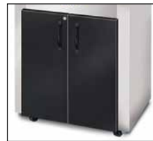
ESLSKK-SS-SS1N (Black/Black Doors)