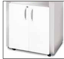
ESLSWW-SS-SS1N (White/White Doors)