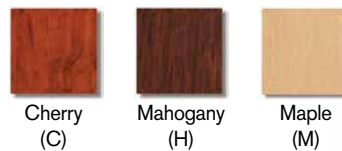
(Colors, styles and availability may change without notice.)