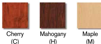
(Colors, styles and availability may change without notice.)