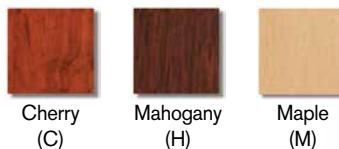
(Colors, styles and availability may change without notice.)